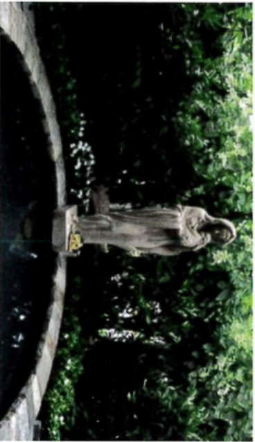
Mary's Garden at the Basilica of the National Shrine of the Immaculate Conception, Washington DC.